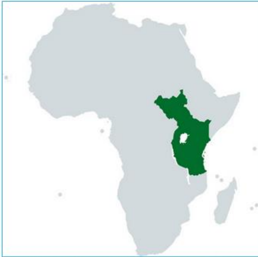
Map of Africa showing the EAC countries in green

East African Community is an intergovernmental organization composed of six countries: Burundi, Kenya, Rwanda, South Sudan, Tanzania, and Uganda.